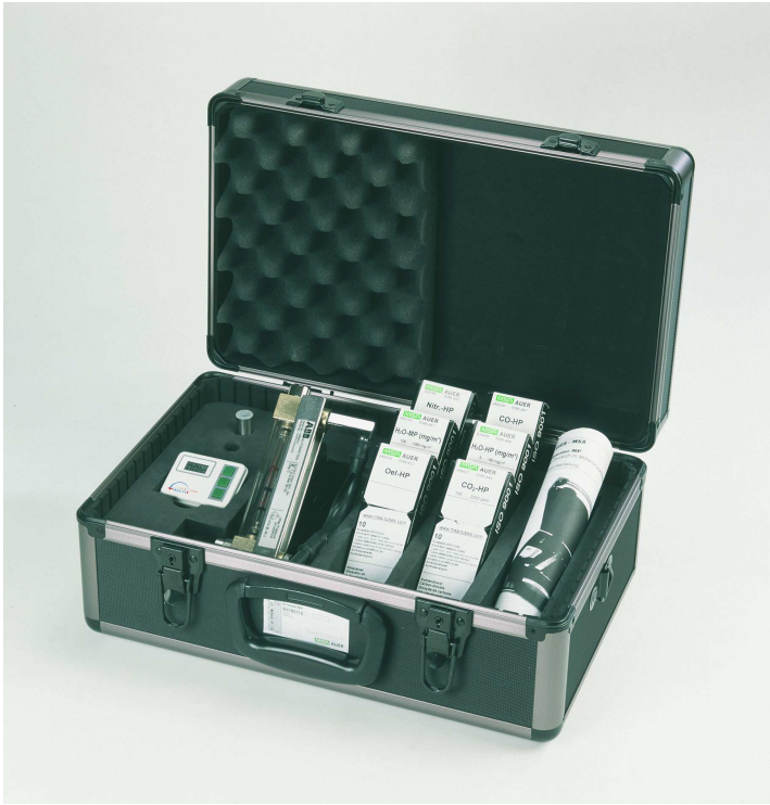
Airtester Kit HP - Part No. D3188701