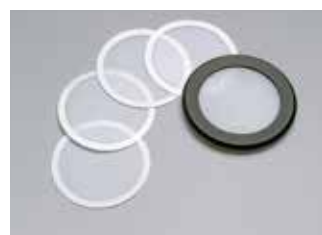
Extra filter containers minimize maintenance and make changing of filters easy