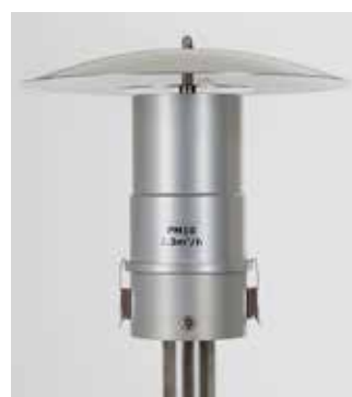
PM 10 inlet head