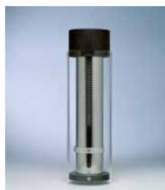
Filters and filter holder